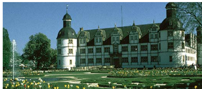
Schloß Neuhaus with its baroque garden

The nearby recreation area Fischteiche (Fish Ponds) is – together with the Pader Lake – an ideal place to go for a walk, to jog, play mini golf or row. Cafés and restaurants invite you in, and children can enjoy themselves on the playgrounds.