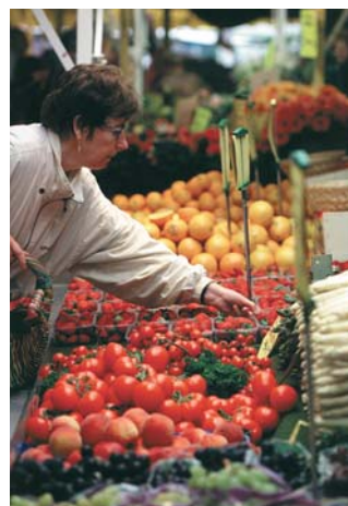
Market at the Cathedral

On Fridays, the cathedral square hosts a "palaver market", on which mainly highly nutritious products and produce from ecological cultivation can be bought. Additional weekly markets – slightly smaller than the one in the inner city – are held in the suburbs: Schloß Neuhaus on Thursdays and in Elsen on Fridays.