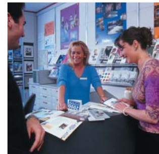
Tourist Information Centre

We will make all hotel reservations for you (free of charge). Call us on: Tel. (0) 52 51/88-29 80 It is possible to receive a list of accommodation directly from us or on the Internet: www.paderborn.de (tourism).