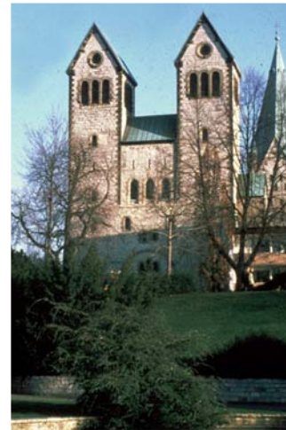
The Abdinghof Church

Price: as for "A short walk" (plus 0.50 € admission fee per person)