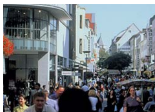
Paderborn's Pedestrian zone

Paderborn's shopping area stretches from the main railway station to 'Giersstraße'. Large parts are pedestrian zone (refer to the inner city map on the back cover).