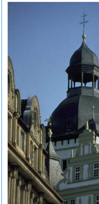
Steinberg and Grünebaum House

From the Tourist Information Centre on the 'Marienplatz' you can buy the brochure "A short guide to the old city" at a price of 1.25 €. This brochure gives a detailed description of all places of interest.