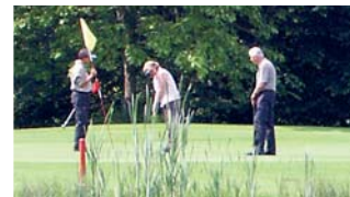
Golf Club Paderborner Land

Culture Weekend from 74 € p. pers./double room Wellness Weekend 215 € p. pers./double room Golf Weekend from 132 € p. pers./double room Cycling Weekend from 109 € p. pers./double room