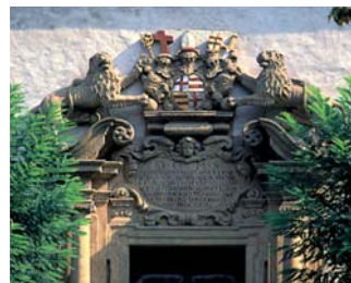
Portal of the Busdorf Church

(No guided tours on Sundays or Public Holidays)