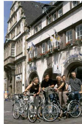
The Tourist Information Centre

Price: 180 min. 67 €, 4 € reduction for school/student groups