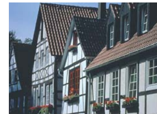
'Auf den Dielen'

Walk past the Abdinghof Church and turn left into 'Michaelstraße'. Two baroque buildings are situated here on the right hand side. In the Geissel Gardens, is the former (8) Domdechanei (Cathedral Deanery) and on the left lies the (9) Michaelskirche (St. Michael's Church) . On the far side of the (10) Geisselschen Garten (Geissel Gardens) , a conservation area encircled by two further arms of the Pader, is the small street 'Auf den Dielen'. The carefully restored timber framed houses are well worth seeing.