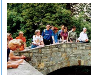
Guided tour in the Geissel Gardens

Every Saturday, 11 am - 12:30: "Short walk through the town". No appointments required. Start at the Tourist Information Centre. For further schedules and reservations for guided tours: Tourist Information Centre. A list of all guided tours offered can be found on pages 10 and 11.