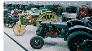
German Tractor and Model Car Museum

Karl-Schoppe-Weg 8 C3 33100 Paderborn Tel. (0) 52 51/49 07 11 E-Mail: info@deutsches- traktorenmuseum.de www.deutsches- traktorenmuseum.de Admission: Adults 5.50 €, reduced rates 3.50 €, pupils 3.50 €, groups (from 15 pers.) 4 €, families 11.50 € Public guided tours: every last Sunday of the month at 11 am