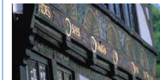
Adam and Eve House

The numbers in blue refer to the town maps at the back of this brochure. The numbers refer to the inner city plan found at the rear of this brochure. You will find the numbers also on the boards of the information and guide system for pedestrians in the town centre.