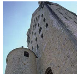
The mighty cathedral tower

The Square in front of the Town Hall leads directly onto the Marienplatz where you will find the Tourist Information Centre and next to that the (5) Heising'sche Haus (Heising House) . Continue past the Mariensäule (Column of the Virgin Mary) built in 1861 and after crossing the road 'Am Abdinghof' you reach the (6) Abdinghofkirche (Abdinghof Church) with its twin Romanesque towers. At the foot of the Abdinghof Church is the western part of the (7) Paderquellgebiet (Pader Springs) with three of the Pader's five main tributaries.