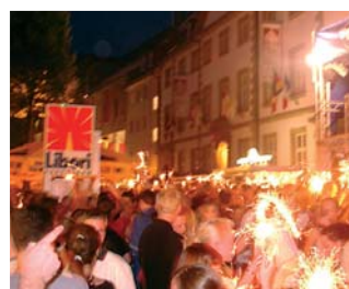
Libori in the city

For more detailed information on events contact the Tourist Information Centre, Marienplatz 2a, 33098 Paderborn, or by calling (0) 52 51/88-29 80. A list of events can be found on the Internet under www.paderborn.de/veranstaltungen